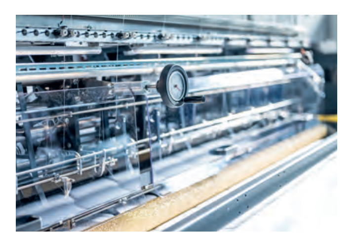
▲ Height adjustable presser feet