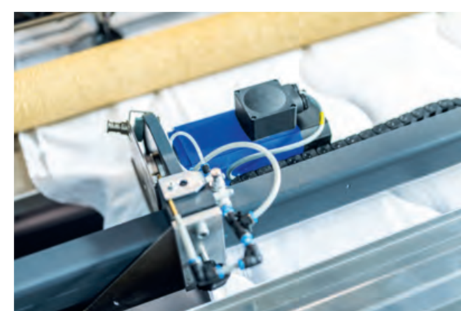
▲ Longitudinal cutter