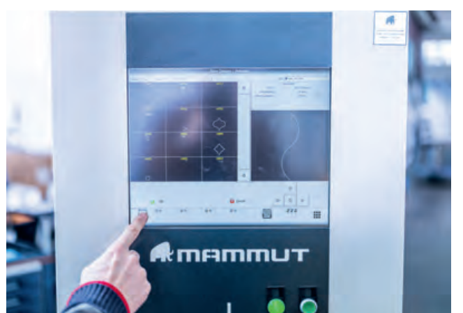
▲ Modern touch control